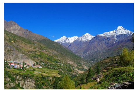
Mountain Serenity in the Hills in Lahaul & Spiti