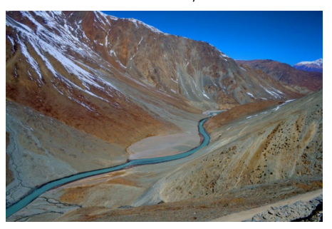
Chandra River Near Kunzam Pass