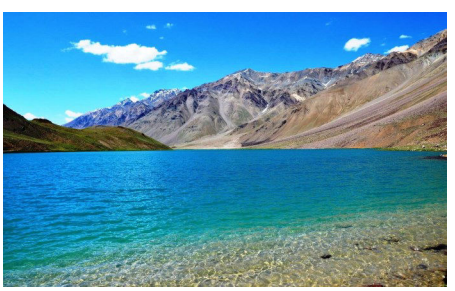
Chandra Tal Lake