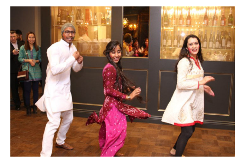
Celebration of Holi Milan in Almaty